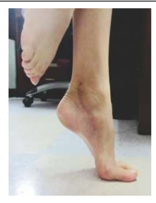
Fig. 3: Six Month Post Operative Patient Able to Resume Position of 'en pointe'