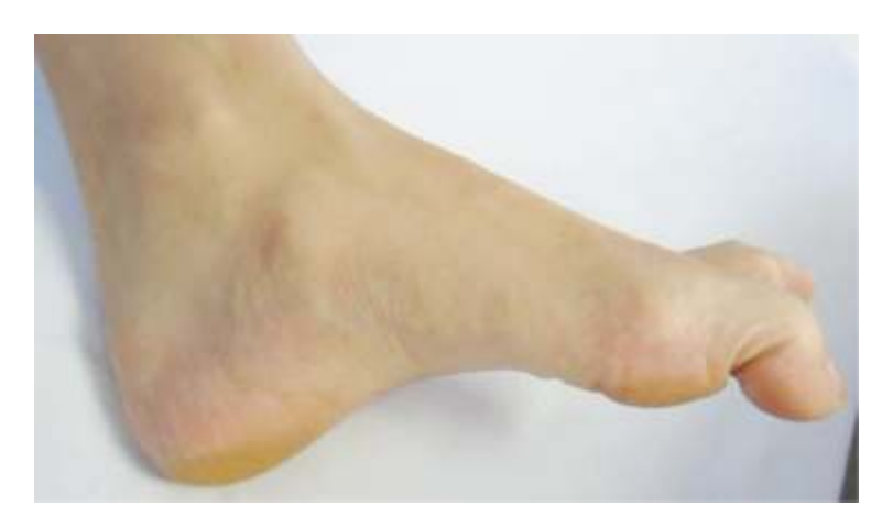
Fig. 1: Flexion Attitude of the Big Toe

was put on a posterior slab for 6 weeks. Rehabilitation process started after 6 weeks, with gradual range of motion and muscle strengthening exercise. She was allowed to resume her ballet dancing after 3 months. On final follow up she was able to resume the position of 'enpointe' with no more triggering of the big toe and pain free (Fig. 3).